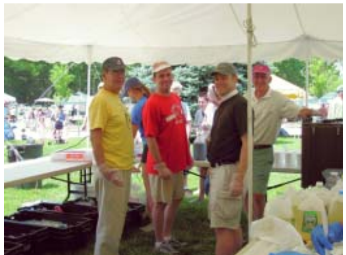
Fair Days = Good Food + Good Fellowship