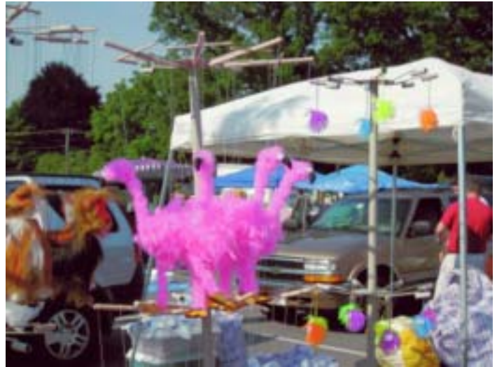
There's something for everyone at Fair Days!

Fair Days is a wonderful opportunity to meet fellow parishioners and to work alongside good friends. It is an opportunity for both fellowship and service. Fair Days takes a lot of work. Hundreds of volunteers are needed to do anything from flip burgers, load furniture in cars or vans, direct parking, pass a soda across the counter, set up and take down tents, bake a cake or cookies and much more. Sign up sheets will be available in late May so please consider spending some time serving your neighbors and many around the globe.