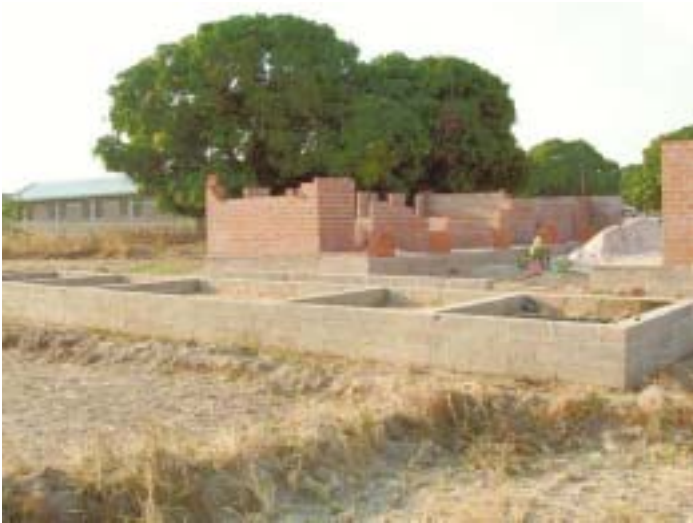
New building with existing building behind the tree

The vestry approved a grant request of $8,500 to complete a project within the Anglican Diocese of Tabora in Tanzania. You may recall that in 2007, we provided some funding to begin construction of dormitories for Women's Bible School in Tabora. The grant approved this month provided the necessary funds to complete the project.