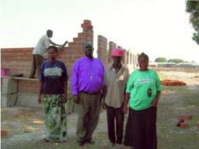
Bishop, students and builder