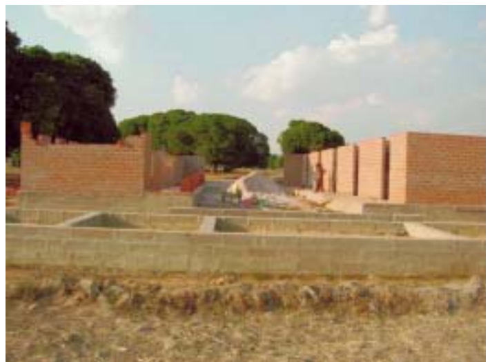
The foundation of two wings with bathrooms