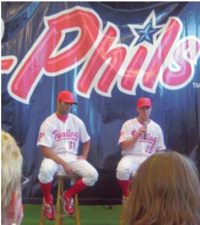
Two members of the Reading Phillies share their stories during last year's Celebrate Your Faith Night

Tickets are only $8, parking is free, concessions are minor-league priced, and there is a great fireworks show after the game. Sign up for a low-cost night out now before your summer schedule gets too full. RSVP to mensministry@good-samaritan.org or call George Scheffey (610-407-0941) for details. You can either meet at the stadium, or carpool from the church, leaving around 4:30pm for the Celebrate Your Faith program. Game time is 7:00pm.