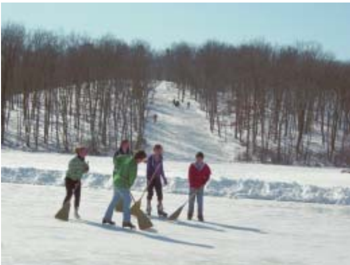
Broomball on Paradise Lake

A high school Super Bowl party at the Figgins gave a chance for group members to grieve the defeat of the Eagles and celebrate the Steelers' victory. The following weekend, the high school group traveled to Pocono Plateau for a weekend of fellowship and winter sports.