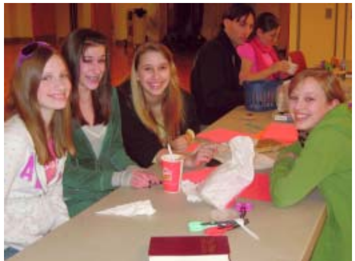
Making greeting cards for alumni college freshmen

The month will end with a new youth group series, Quest, designed by Youth for Christ, Vancouver as an outreach tool for middle and high school students. During the seven weeks of Quest, students are encouraged to invite friends. Youth who have not been involved with youth group are invited to come talk about the Christian faith in an interesting, informative format.