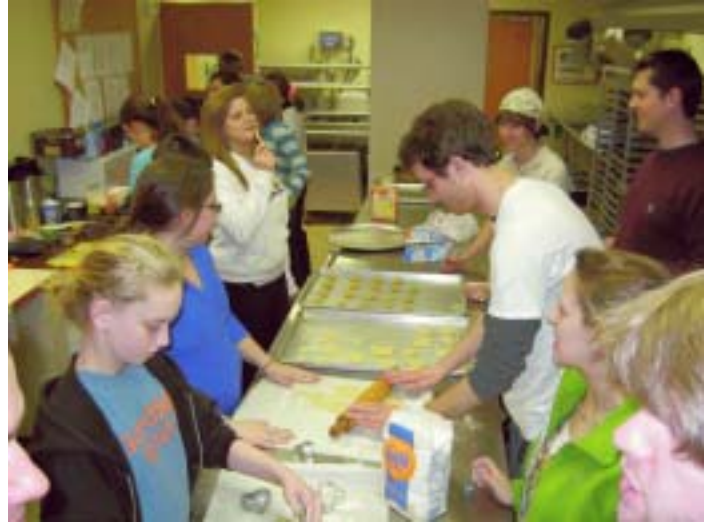
This is what 1,000 cookies looks like!

An Everything Party over President's Weekend celebrated presidential birthdays, past youth group leaders, Valentine's Day, and our recent alumni. Students, leaders, and a patient parent baked almost 1000 cookies to send to sixteen college freshmen, along with personalized handmade cards.