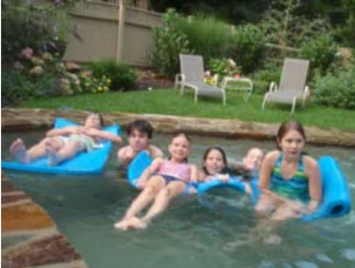
Summer Bible Study in the Gallagher's pool

Back home again, 22 youth and leaders gathered for the 30 Hour Famine, fasting for 30 hours while raising over $2,000 for famine relief, both through sponsorships, contributions, and a very busy Saturday morning car wash. As part of the 30 Hour Famine, the teens also rang doorbells in the neighborhood around Good Samaritan, talking about hunger, inviting neighbors to the carwash, and gathering food for Good Samaritan's food pantry.