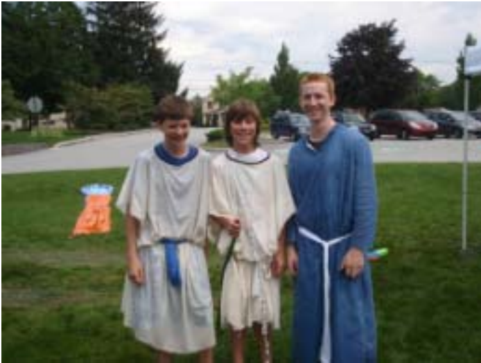
Marketplace Games Team

Good Samaritan youth have been active in service this summer, in ways that have impacted our neighborhood and local community, as well as more distant places.