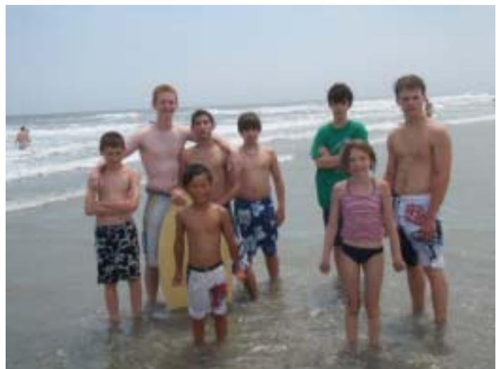
Beach Day at Sea Isle