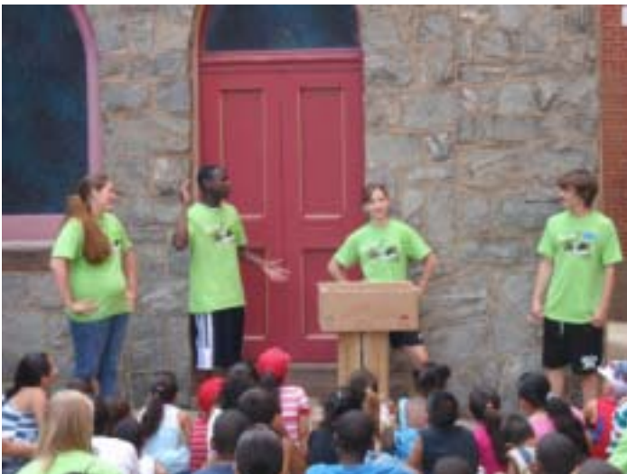
Urban Serve drama in St. John's courtyard