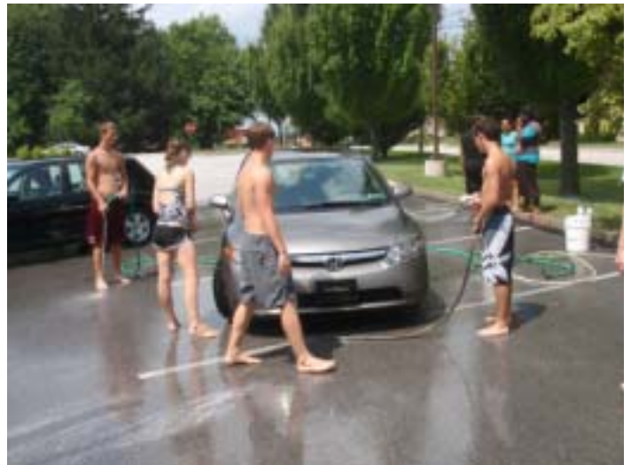
30 Hour Famine Car Wash