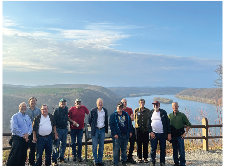
Some of the men went for a hike

What comes through in all of these activities is how important building friendships and deeper relationships with other guys can be to reinforcing our commitment to the church and strengthening our relationship with Jesus Christ.