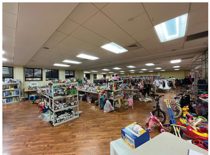
Twice is Nice Ready to Open for Business