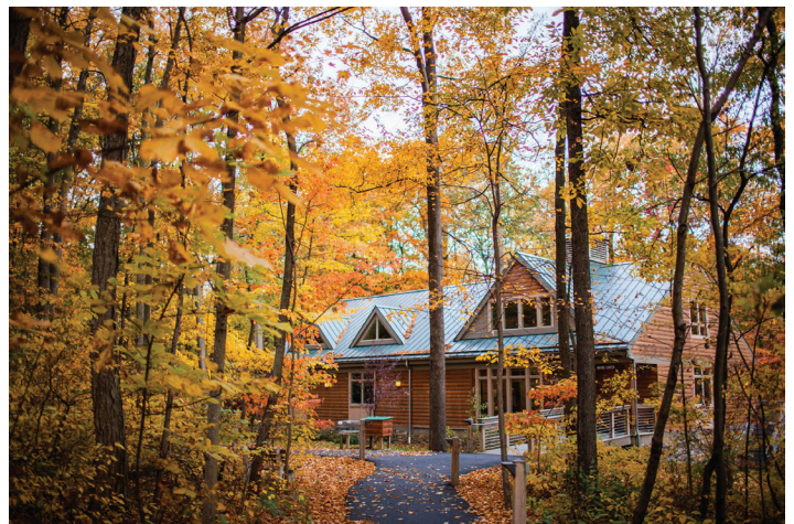
Black Rock Retreat