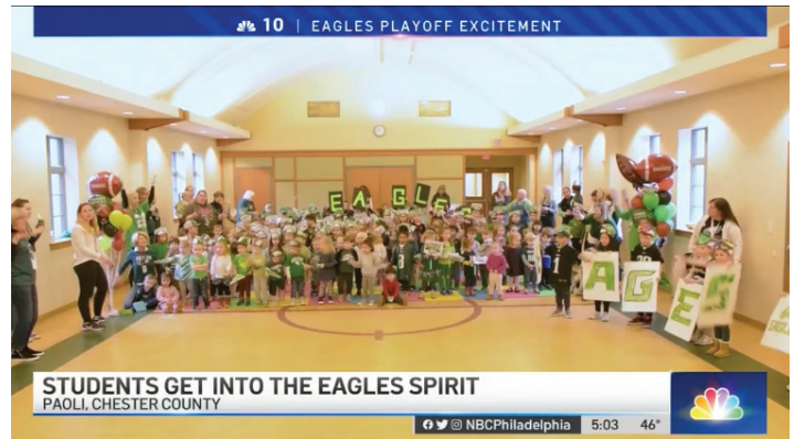
Eagles Pep Rally

We have collected data and formed a committee to upgrade our playground and fundraise for some new playground equipment; hopefully this summer. Our goals to improve instruction and our programs are always ongoing!