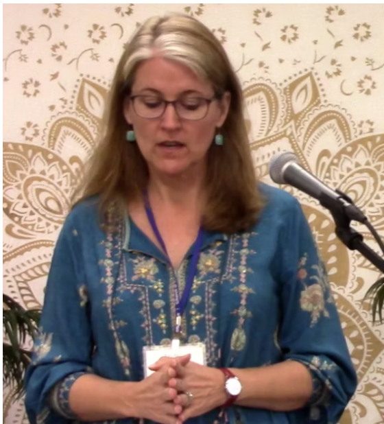
Insight for Life presented a Fall Study on the Book of Acts

Most of us remember the old nursery rhyme, complete with hand motions: “Here is the church, here is the steeple. Open the doors and see all the people.” Additions and modifications throughout the years include: “Here is the pastor going upstairs and here he/she is saying their prayers” or “The doors are wide open to welcome all people.” With another year of experiencing Covid, we might end the rhyme with, “Open the doors, where are the people?”