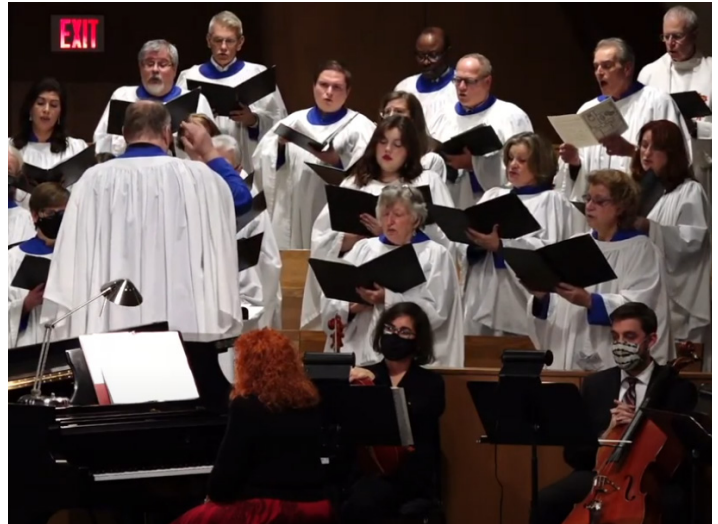
Christmas Eve 5pm Choir

The contemporary service band has provided music for all of the 11:00 services throughout the year.