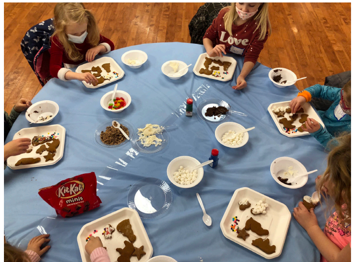
Good Sam Kids Craft Time