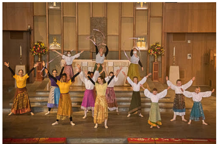
The Dance Choir's Virtual Christmas Concert