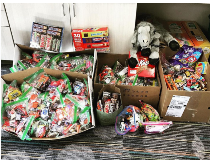
Students collected candy for the Food Closet

I am honored to be serving in our church at our school. For Day School information email Barb at barb.condit@good-samaritan.org .