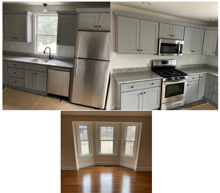
Some renovations to the Old Rectory

As we look to 2022 we pray that God will continue to use the Church of the Good Samaritan to spread the Gospel to Paoli, the Philadelphia area and around the world. Thank you for your continued financial support!