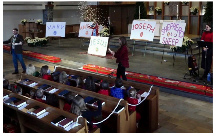
Christmas Eve Family Service

In some ways, the COVID pandemic hit Youth Ministry the hardest. There just was not a virtual version of our ministry that ever felt quite right. This is one of the reasons we were very excited to welcome students back to the church campus in 2021! In the Spring, we held outdoor youth group (mostly small group-based) and moved indoors only when the weather forced us. In the summer we were able to have Bible studies at Starbucks and a local pizza shop. We even had a (very delayed) pool party in August! In the fall, the Youth Leaders did an amazing job making an "outside kickoff event" happen.