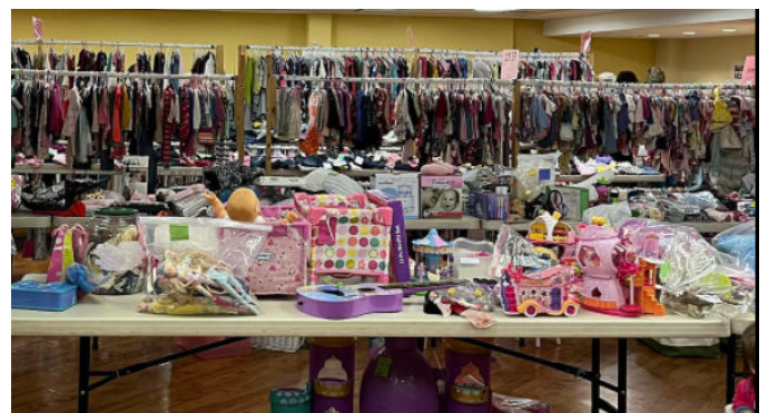
Another succesful Twice is Nice Sale