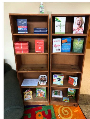
Resource center in the atrium