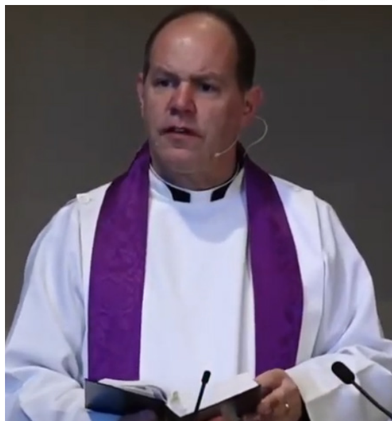
Sharing the Gospel