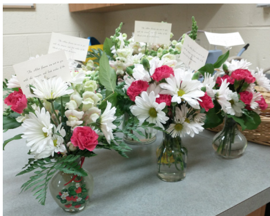
Arrangements to be taken to visits by Pastoral Staff

See what kind of love the Father has given to us, that we should be called children of God... and so we are. -1 John 3:1a