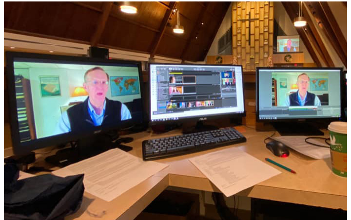
View from the Sound Booth