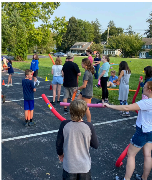
Youth Group - Outside!

We thought it appropriate to end this report by mentioning our 2021 graduating class. It was one of the largest we have had in recent memory. SO many of our students finished their time in High School and moved on to their next chapter during covid, which meant that we couldn’t really “send them” and celebrate them in the usual way. If any of the grads are reading this, please know that we are so incredibly proud of you, we love you, and we hope you always consider Good Sam a spiritual home. We know that God has big plans for you!