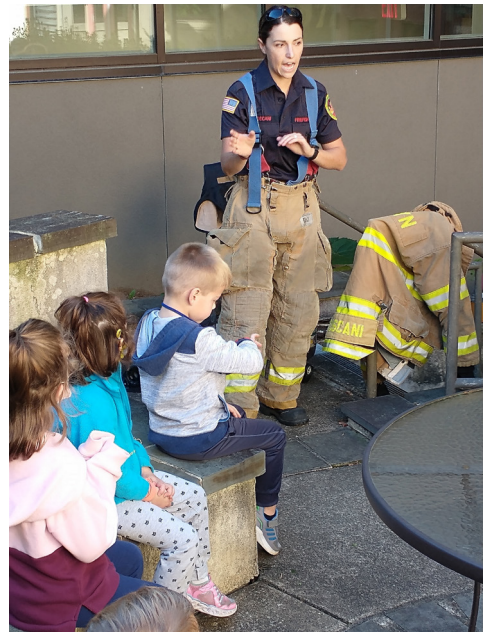
Day School Fire Safety Presentation