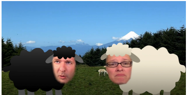
"Did Ewe know?" Now a classic and a tradition.